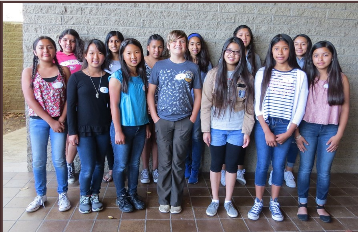
Blackwell Session Campers