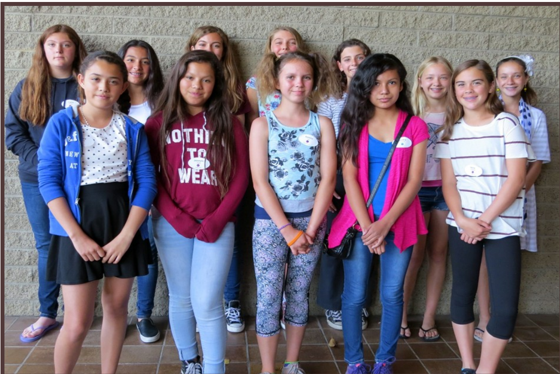
Hypathia Session Campers

MANY THANKS to the many individuals and companies who make it possible for us to extend this life-changing opportunity to so many young girls. Special recognition goes to our major corporate donors :